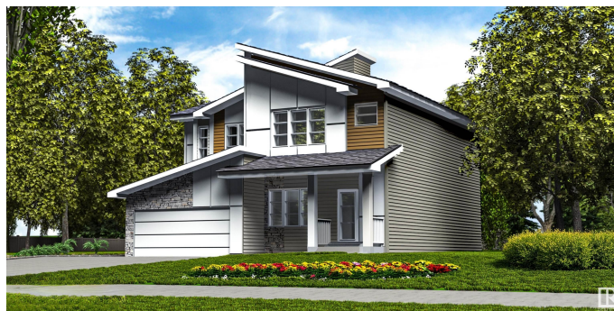
The Deveraux | 1,411 Sq. Ft.

MLS® # E4433250 Price $457,900 Bedrooms 3